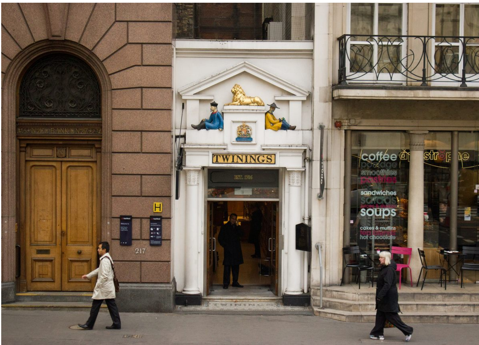
Original Twinings tea shop on the Strand in London, UK. The original logo can be seen above the main entrance.